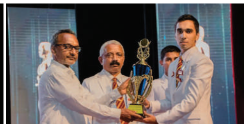
Clubs' Night 2018 was held on the 19th of July 2019 at the Kularathna Hall under the distinguished patronage of former minister of Mass Media Hon. Imthiaz Bakeer Markar.