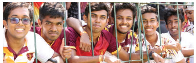
90th Battle of the Maroons was held at the SSC grounds on the 2nd & 3rd of March 2019