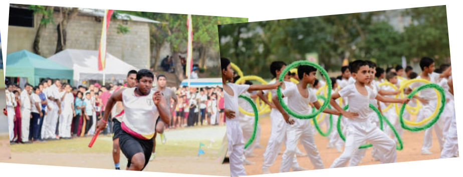
Annual Sports Meet was held at the College grounds on the 8th of February 2019