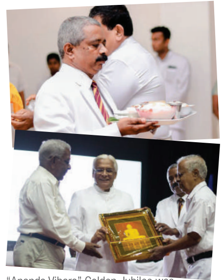
“Ananda Vihara” Golden Jubilee was celebrated on the 13th of March 2019